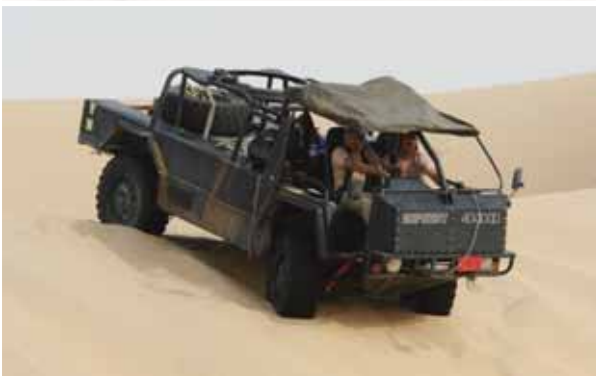
Clockwise from top left: Finnish Air Force ground power unit with integrated 152 hp B Series (Houchin), French MPI Beach Recovery Vehicle powered by the ISMe, 420 hp (MPI), HMT 4x4 400 Series air-portable Special Forces vehicle powered by the ISBe 185 hp (Supacat)

In this respect, Cummins engines are highly regarded by leading equipment manufacturers – offering higher power density with unrivalled levels of durability. For engineering, handling and airfield support equipment, a full range of engines are available that meet global low emission standards for off-highway applications.