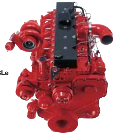
8.9 litre ISLe

These highly advanced engines provide outstanding power density for higher speeds as well as with exceptional fuel-efficiency and sustained operations. To meet Euro 4 and Euro 5 emissions with clean combustion techniques Cummins engines reduce both thermal and visible smoke signature to very low levels, helping to prevent detection. The engine quality well recognised by leading manufacturers of both wheeled and tracked Armoured Fighting Vehicles (AFVs), as well as close relatives such as Armoured Personnel Carriers (APCs) and reconnaissance vehicles.