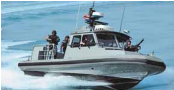
SeaArk 34 Ram Patrol Vessel powered by QSB5.9

Cummins diesels supply power for every type of military application worldwide: wheeled and