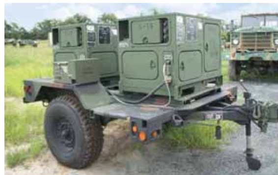
The Advanced Medium Mobile Power Sources (AMMPS) for on-site power generation

The Advanced Medium Mobile Power Sources (AMMPS) is the future of power in the field. For on-site power the multi-fuel rugged generator operates in all environmental extremes. Highly reliable it provides excellent power quality and battlefield mobility.