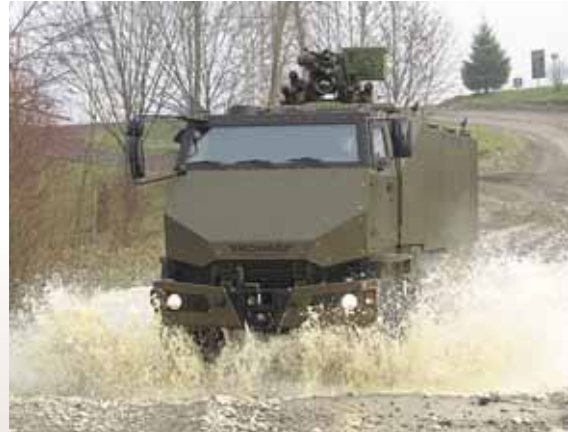
Duro III P powered by ISBe 5.9 245 hp (Mowag)

In-service reliability is further assured thanks to smart self-protection systems preventing engine wear from cold starting, overheating or excessive idling. Extended service intervals and reduced maintenance also ensure higher than ever levels of vehicle availability.