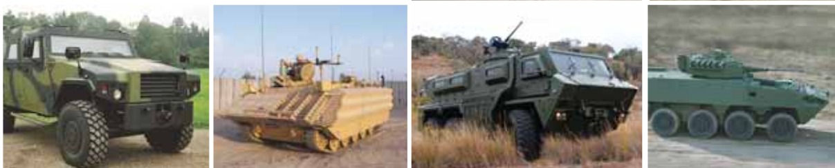
Clockwise from top: British Army FV430 MK3 powered by 6BTAA 250 hp (BAE Systems), ARMA 8x8 armoured vehicle powered by ISLe T450 hp (Otokar), Portuguese Army Pandur II 8x8 AFV available with ISLe T450 hp (Steyr-Daimler-Puch), the RG-35 is a multi-purpose mine protected armoured vehicle, powered by an ISL 450 hp (developed as a private venture by BAE Systems in South Africa), British Army Bulldog upgraded armoured fighting vehicle powered by 6BTAA 250 hp (BAE systems), Danish Army Eagle IV Armoured Patrol Vehicle with ISBe 250 hp (Mowag)

While a new generation of AFVs may offer improved operational capabilities, military forces are also looking at cost-effective methods of upgrading existing vehicles. Cummins repower capability has dramatically extended the life of armoured equipment in many projects – while enhancing performance, reducing fuel consumption and lowering maintenance costs.