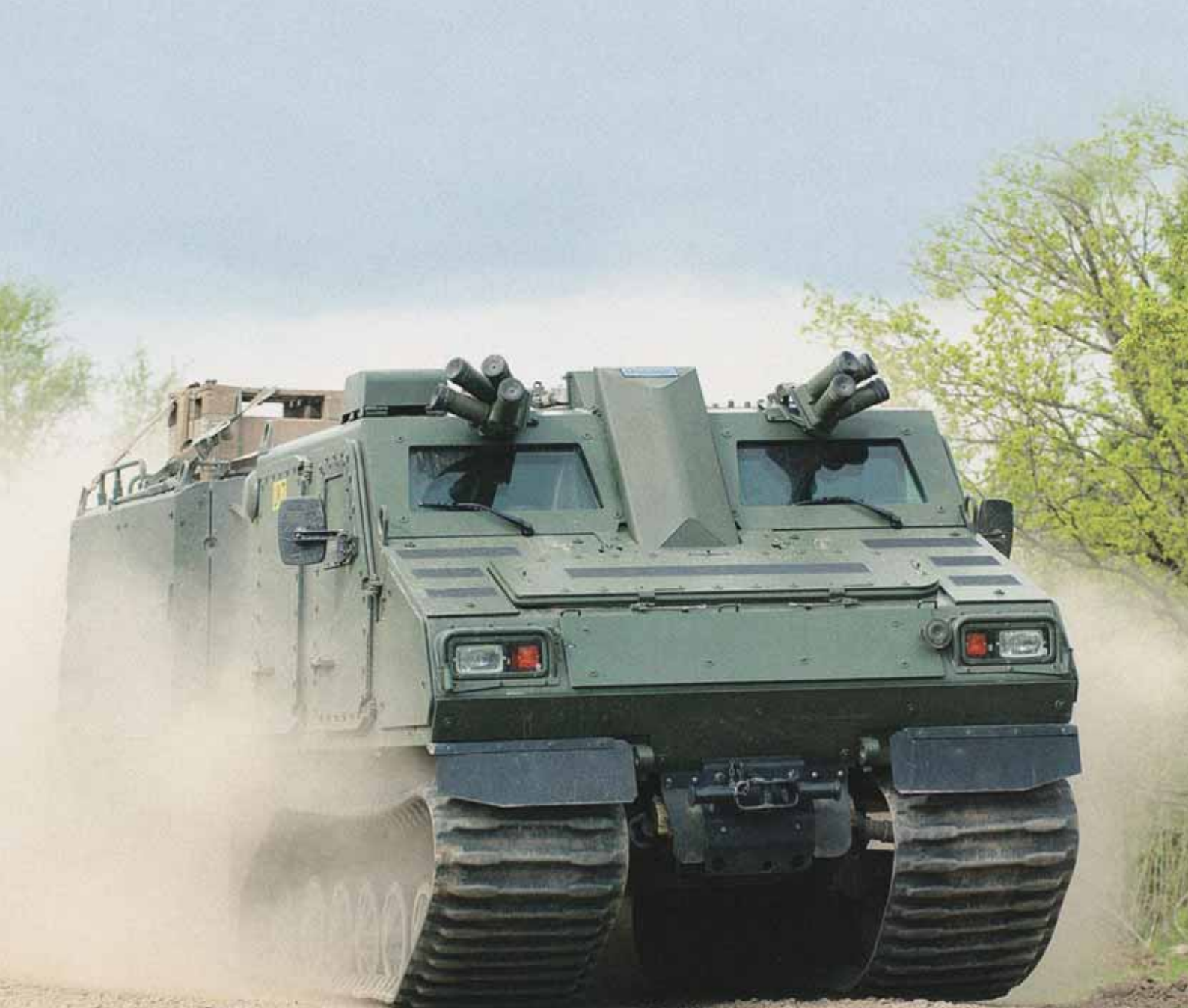
BvS10 armoured all-terrain vehicle powered by the ISBe 281 hp (Hägglunds)