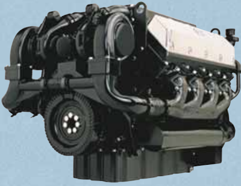
M2/M3 Bradley family, powered by the 600 hp V903 (BAE Systems)