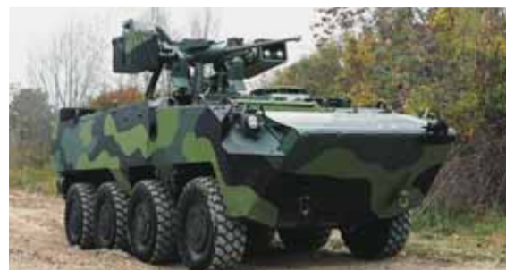
Czech Army Pandur II 8x8 AFV powered by the ISLe T450 hp (Steyr-Daimler-Puch)

* In battlefield situations the engine can run on military fuels without system derate, utilising emergency vehicle ratings.