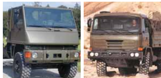
Clockwise from top left: UK Royal Air Force 6 x 4 aircraft refueller designed for air transportability, powered by a 245 hp C Series (Dennis Eagle), Duro III military tactical vehicle 6x6 powered by ISBe 185 hp (Mowag), High mobility 6 x 6 tactical truck powered by an ISM 400 hp (ATC/TATRA)

receiving area ready for onward transfer. Specified to military standards, these vehicles require engines with first class reliability, fuel-efficiency and the ability to cope with low standard roads. Cummins heavy-duty engine range is ideally suited for this vital support role.