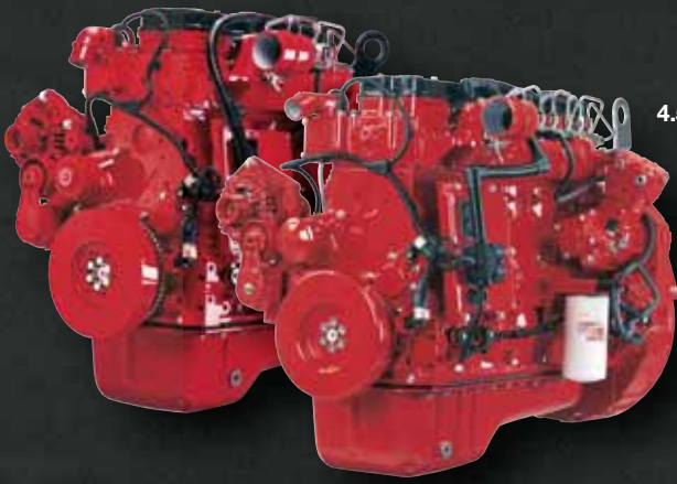
4.5 & 6.7 litre ISBe

Peacekeeping, intervention and expeditionary operations are driving the demand for lighter, more mobile AFVs suitable for rapid deployment and all-terrain capability . Despite sophisticated protection and enhanced firepower , out in the field this new generation of AFVs will need to rely on speed and concealment to ensure survivability – utilising the latest clean combustion technology offered by the Cummins engine range.