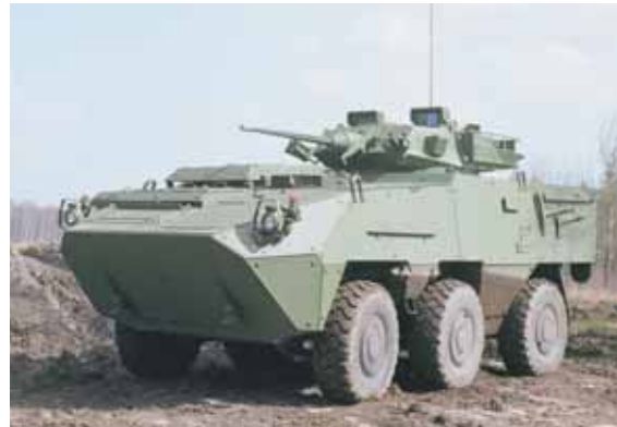
Pandur II 6x6 AFV available with ISLe 450 hp (Steyr)

Commercial product adapted for military use, the V903 engine is a diesel engine with proven military credentials. A 14.8 litre (903 C.I.D.) 90 degree vee 8 cylinder format provides high power density, enhanced by 32 valves and compact air to water after cooling. The highest rated versions feature electronic controls with a hybrid fuel system and turbo charging options to tailor the product to any needs. Lower ratings