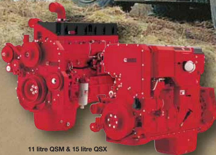
11 litre QSM & 15 litre QSX

RTCH Rough Terrain Container Handler adapted for the US Army, powered by a 375 hp QSM11 (Kalmar Industries)