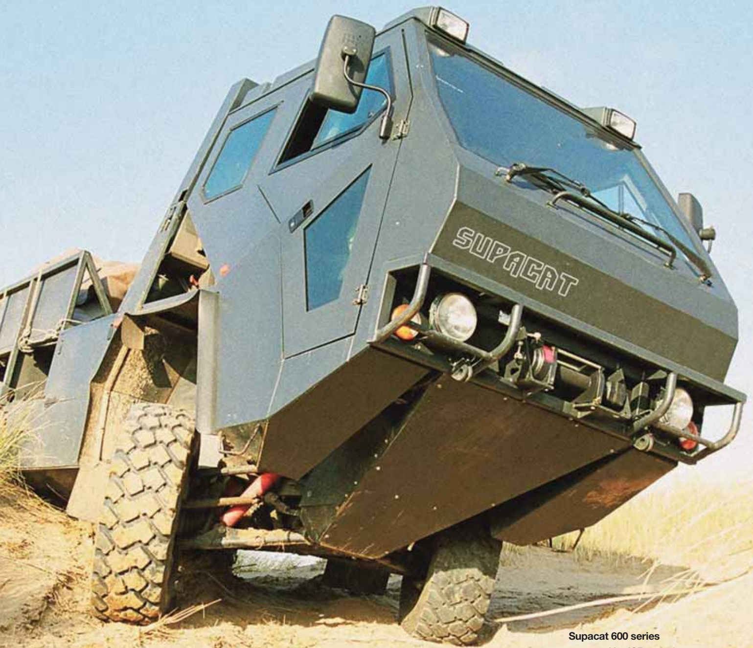
Supacat 600 series powered by ISBe 185 hp