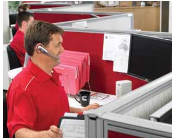
The Cummins Support Centre boasts a team of highly experienced service technicians who are based at a dedicated facility in Melbourne.

With Cummins you're not just buying an engine, you're buying a partnership with all the support, services and parts you need.